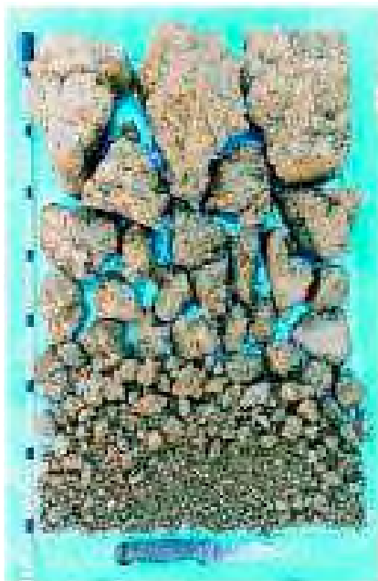
Poor (0) Soil dominated by extremely coarse, very firm clods with very few finer aggregates.