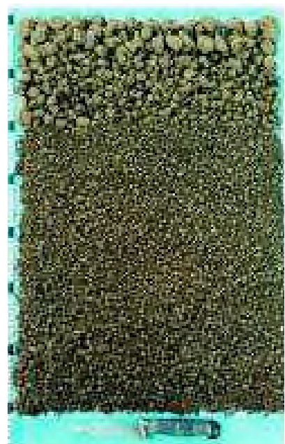
Good (2) Good distribution of friable finer aggregates with no significant clodding.