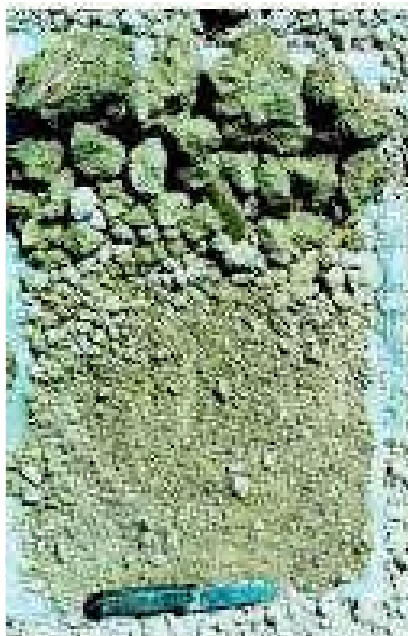
Medium (1) Soil contains significant proportions of both coarse firm clods and friable, fine aggregates.