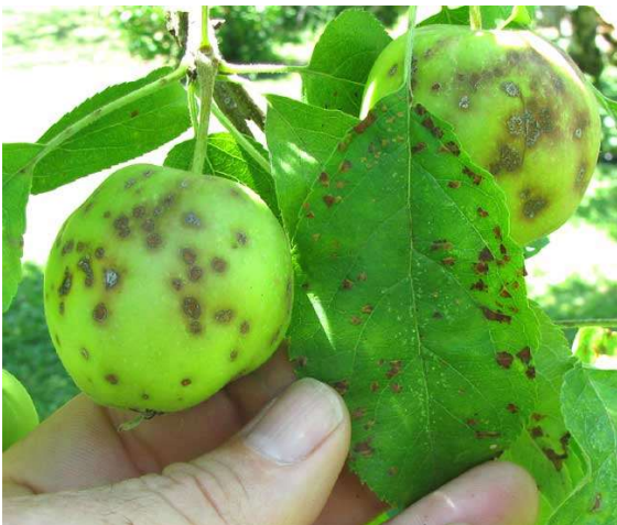
FRUIT SCALE OF 3 (26-50% fruit affected with scab)